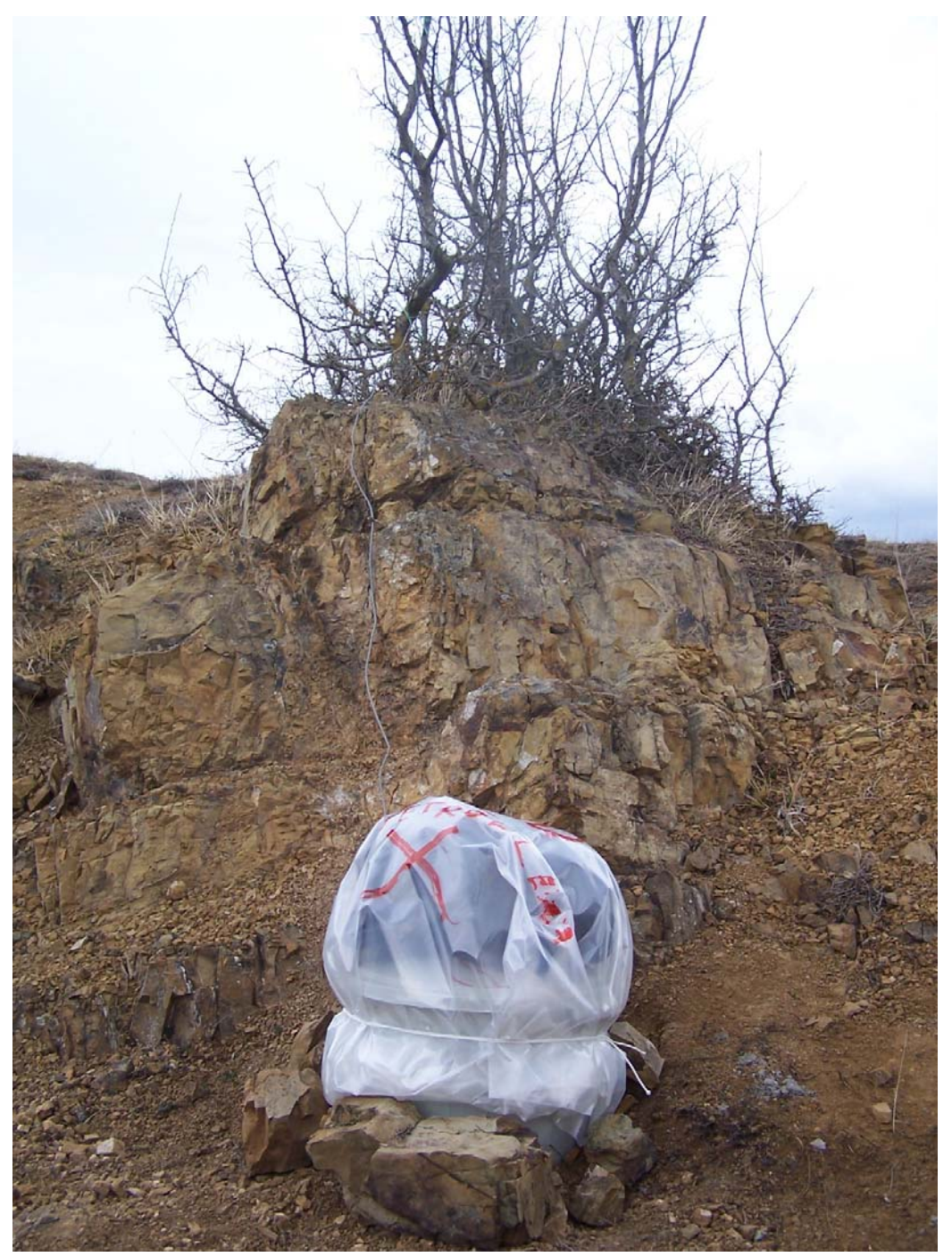
'Cistern' (original site prepared 5/2/05 and later destroyed by locals, reprepared 26/2/05, deployed 27/2/05, serviced 28/2/05 and 4/3/05).

Location: 41 05.759 N, 36 04.217 E; 37 T 253949 4553549