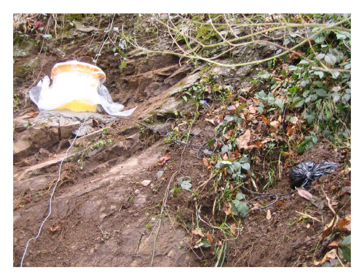
`Village Tea' (prepared 30/1/05, deployed 1/2/05, serviced 14/2/05, 18/2/05)

Location: 41 5.381 N, 40 53.342 E (Ali = 41 5.367 N, 40 53.278 E), 37 T 658608, 4550377 (Ali = 658570, 4550404) *double check*