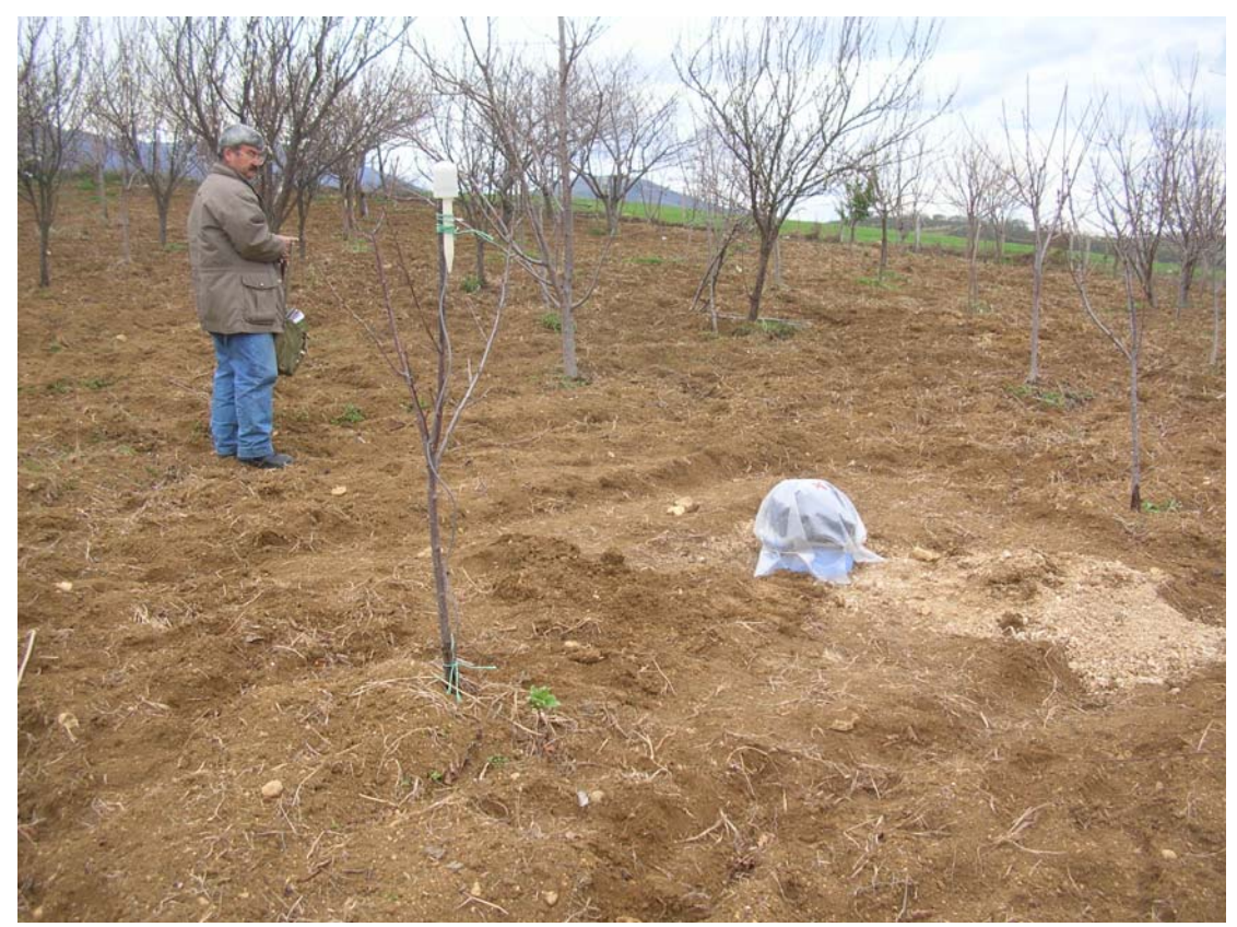
`Fruit of Ali' (prepared 26/2/05, deployed 27/2/05, serviced 1/3/05 and 4/3/05).

Location: 41 19.294 N, 36 13.863 E; 37 T 268251 4578155