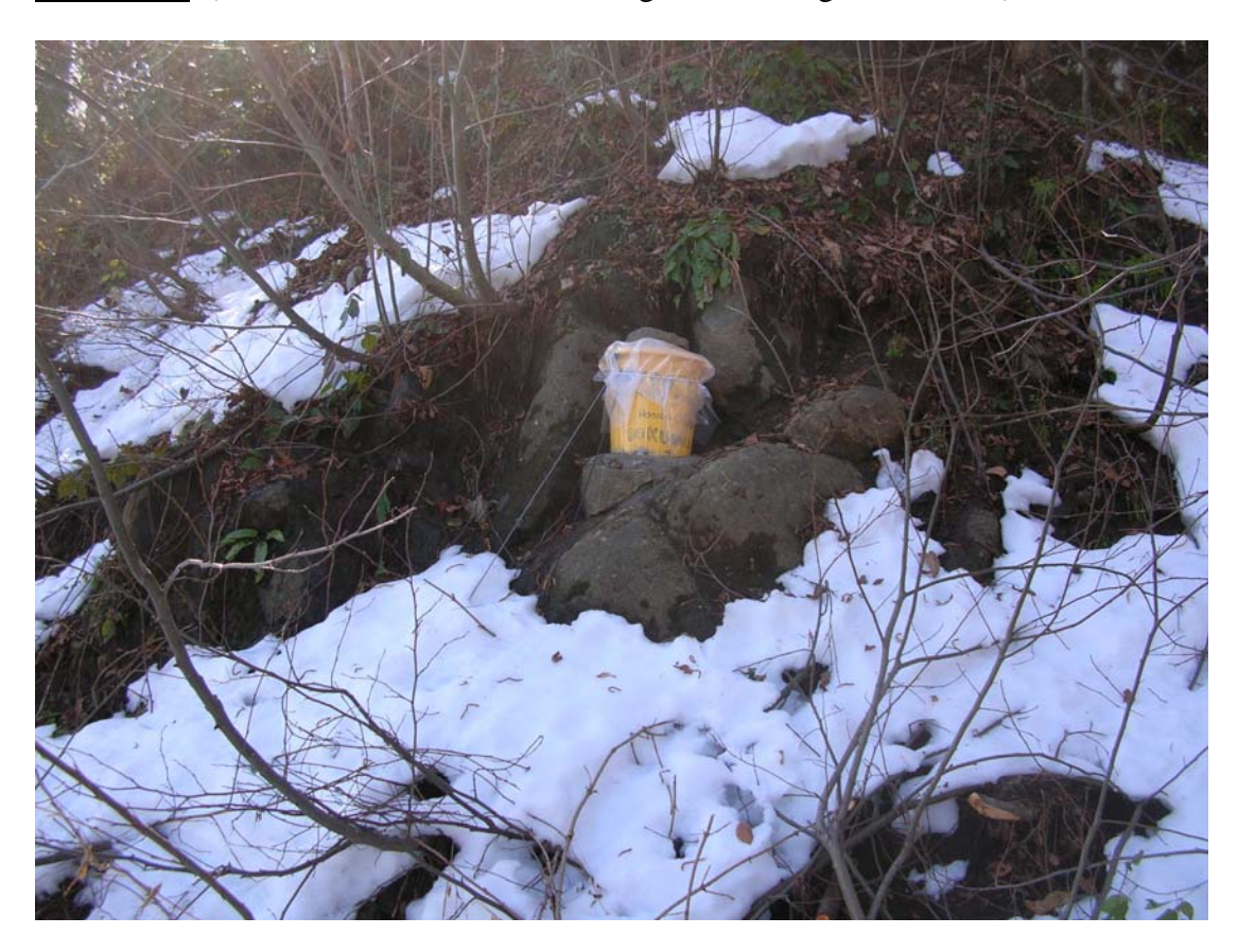
Station 1.1 (CMG-6TD-6145, G3744 damaged and changed to G3896)

`Priest's House' (prepared 30/1/05, deployed 2/2/05, serviced 17/2/05)