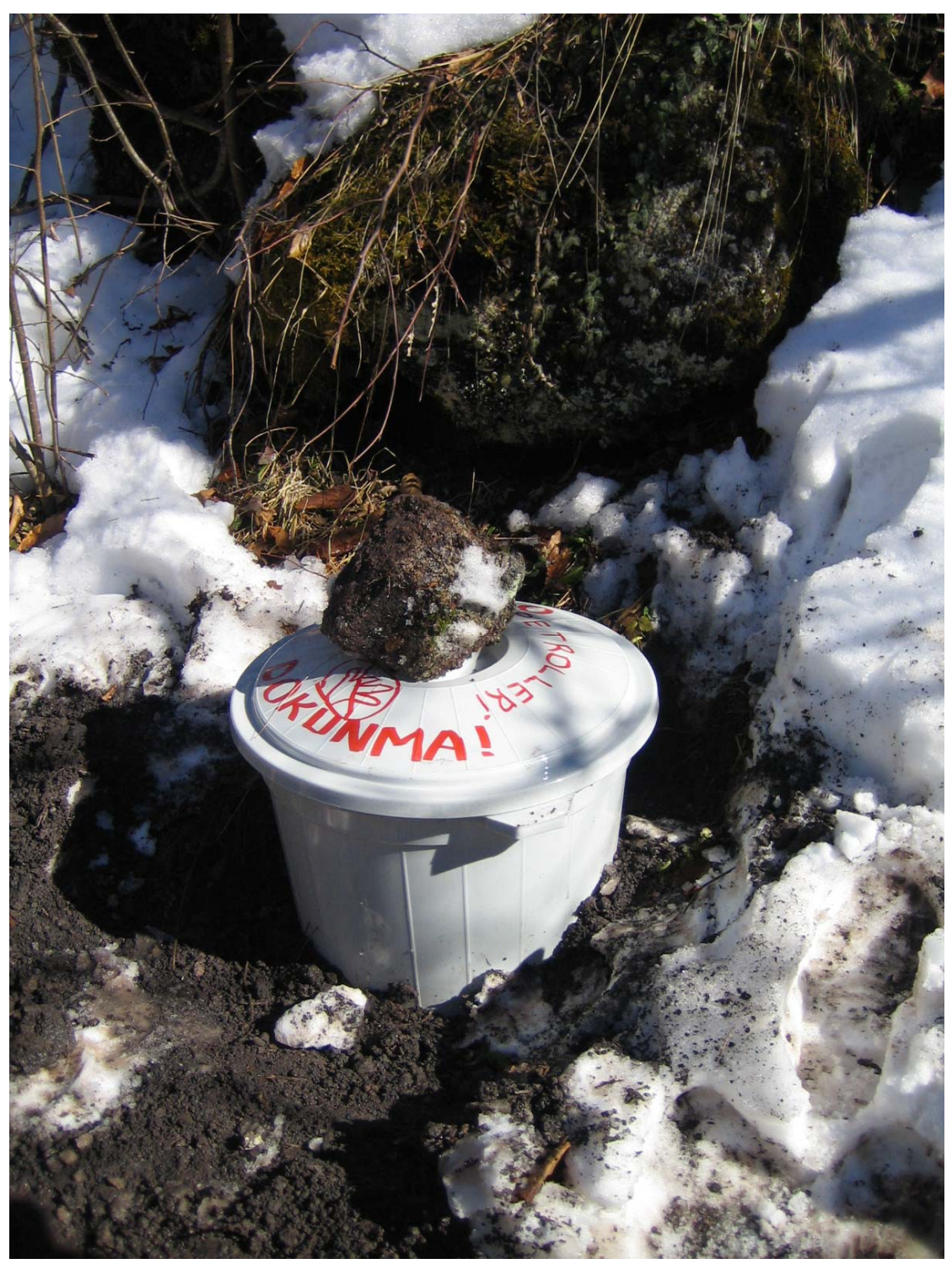
Location: 41 1.554 N, 41 0.335 E, 37 T 668619, 4543574 Altitude: Max-gps = 470 m, barometric = 450 m, Ali-gps = 425 m *double check* Driving: From Camlihemsin turn R at fork on way out of town. Pass Jandarma station and continue to bridge and take L turn. Continue up steep dirt track to hamlet. Site: Hamlet is called Konaklar. Headman = ? Site is located at back of tea garden up steep slope just at edge of forest.

Geology: Dark coloured andesitic basalt of Upper Cretaceous age. Dug down into sub-crop which rapidly became more rock-like. Not quite bedrock but close (altered). Concrete plinth added.