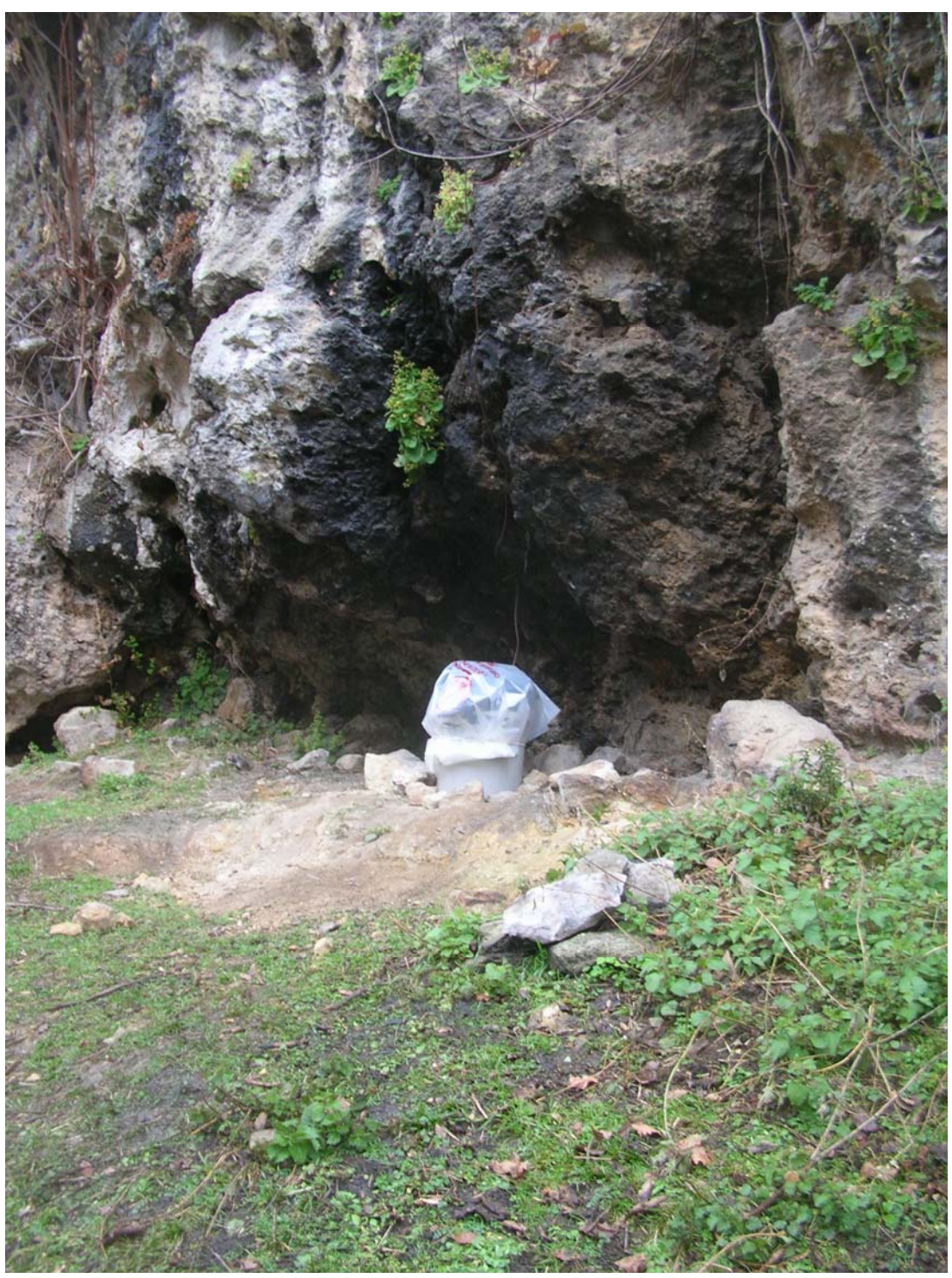
<u>Station 2.5:</u> Location name: Katy's Gambit

Accessibility: Gelivera river is in Espiye, right side of Gelivera river there is a road which goes villages which are located within drainage area of the river. Take this road go through along this road until Yeniköy exit which takes almost 1.5 hour from Espiye. Instead of taking Yeniköy exit, take left walking track which goes to Avluca village. There is a limestone cliff left side. St. L.2.5 is located at bottom of that cliff. Land owner: Niyazi Bayrak, his phone 0454 626 23 52