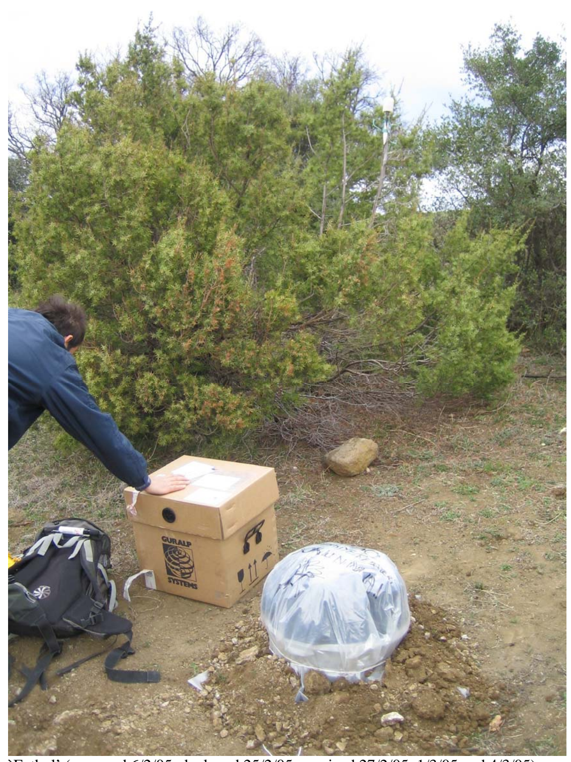
`Futbol' (prepared 6/2/05, deployed 25/2/05; serviced 27/2/05, 1/3/05 and 4/3/05)

Location: 41 17.749 N, 36 12.490 E; 37 T 266244 4575357 Altitude: gps-max=293 m, barometric 247 m, nicky-gps=254 m, ali-gps=250 m.