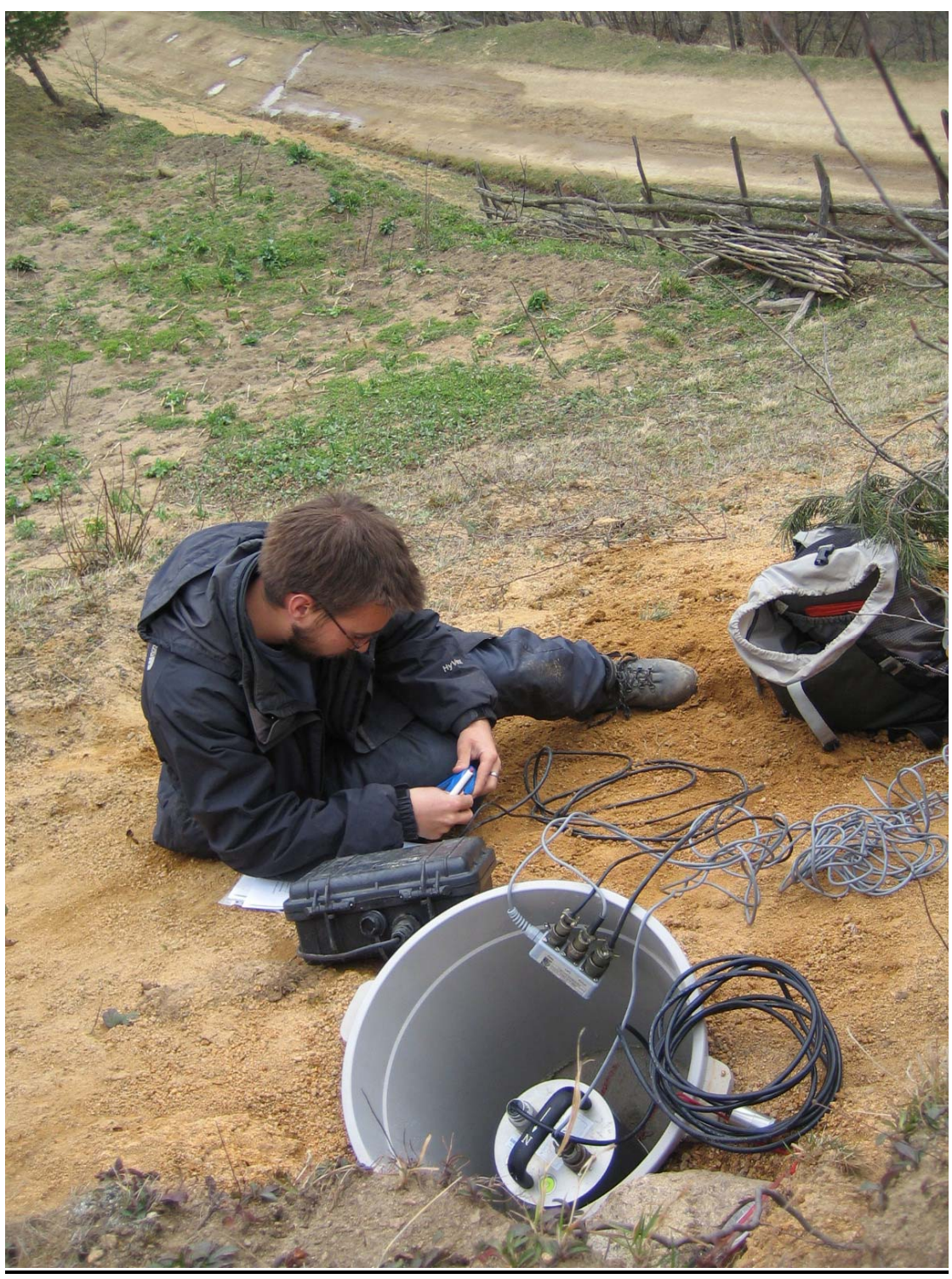
Location name:Reginald's Reach, Reginald's Reach Around.