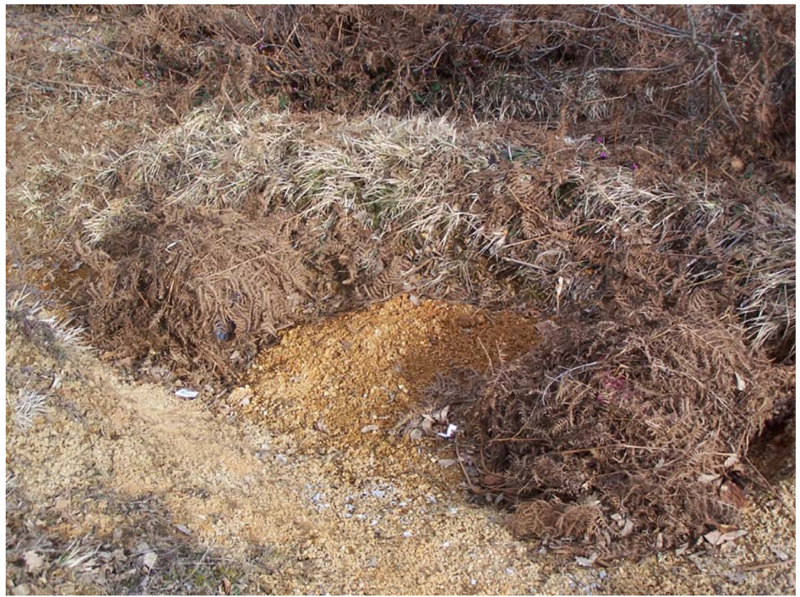
'Valley of Doom, Prequel' (prepared 5/2/05, deployed 25/2/05, serviced 26/2/05, 28/2/05 and 3/3/05).