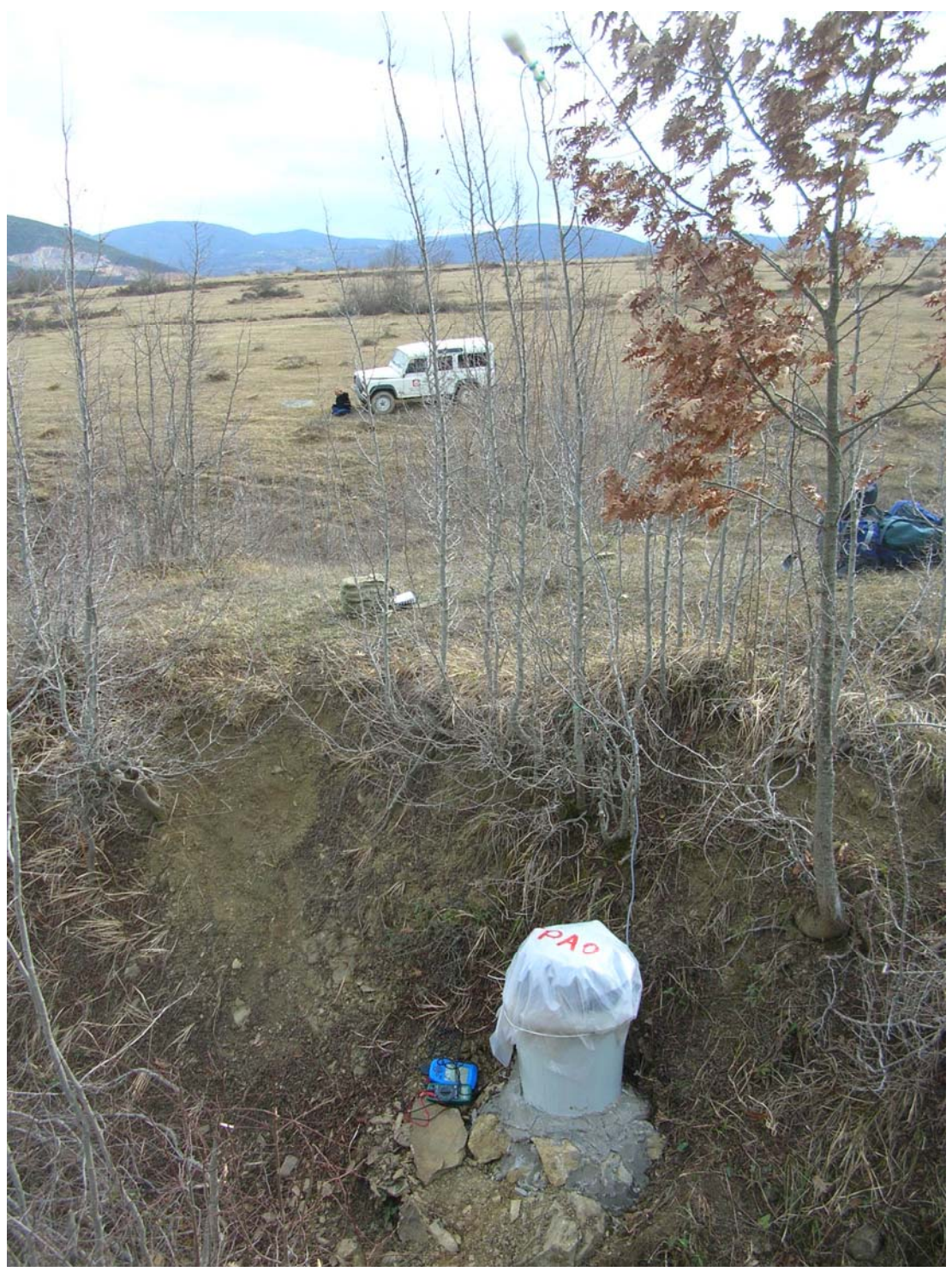
Grave Rubber' (prepared 4/2/05, deployed 25/2/05, serviced 27/2/05, 28/2/05 and 4/3/05).

Location: 41 2.875 N, 36 2.069 E; 37 T 250760 4548314