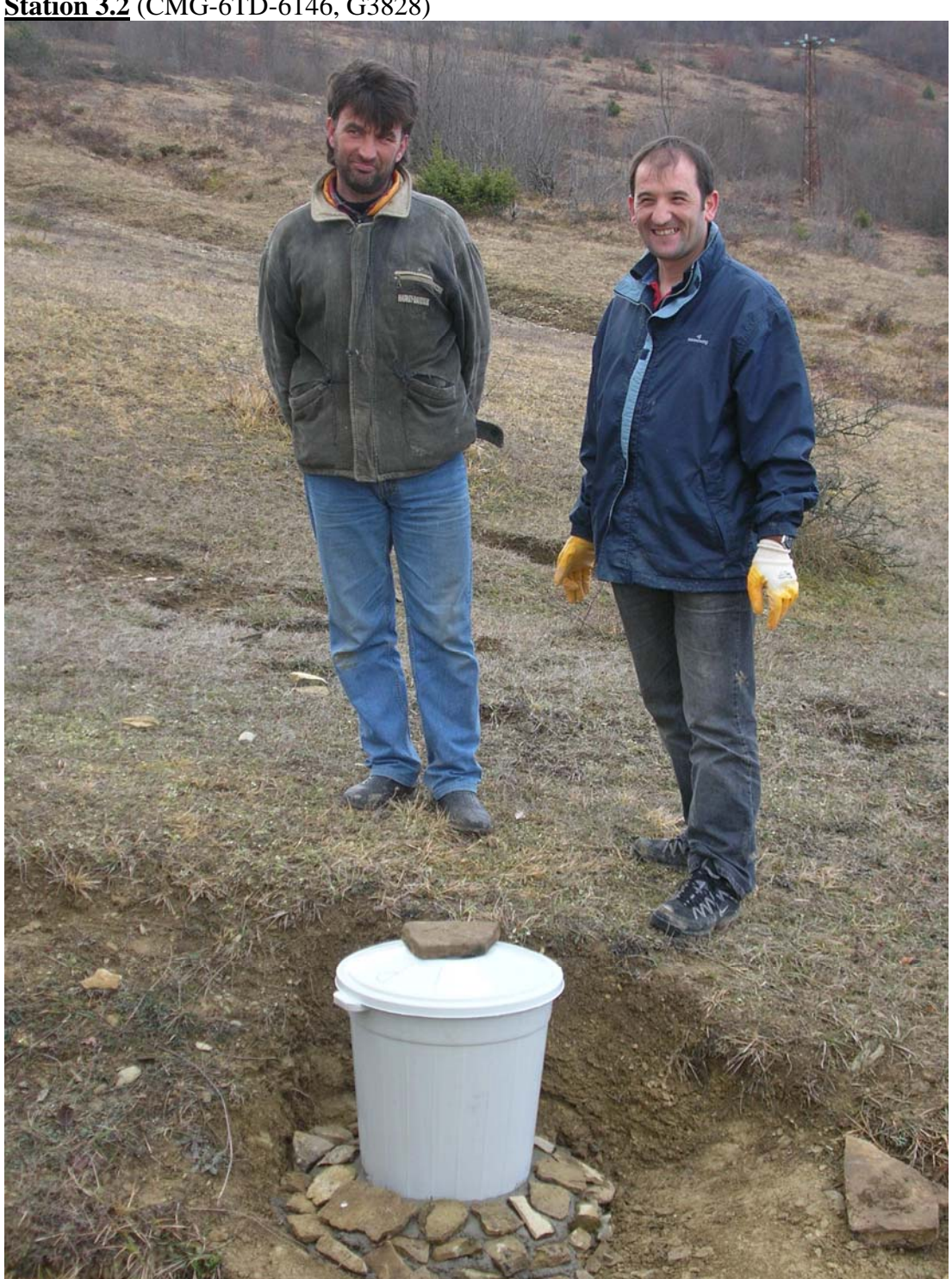
'Cay-Alien' (prepared 5/2/05, deployed 25/2/05, serviced 27/2/05, 28/2/05 and 4/3/05).

Location: 41 13.891 N, 36 10.071 E; 37 T 262634 4568328