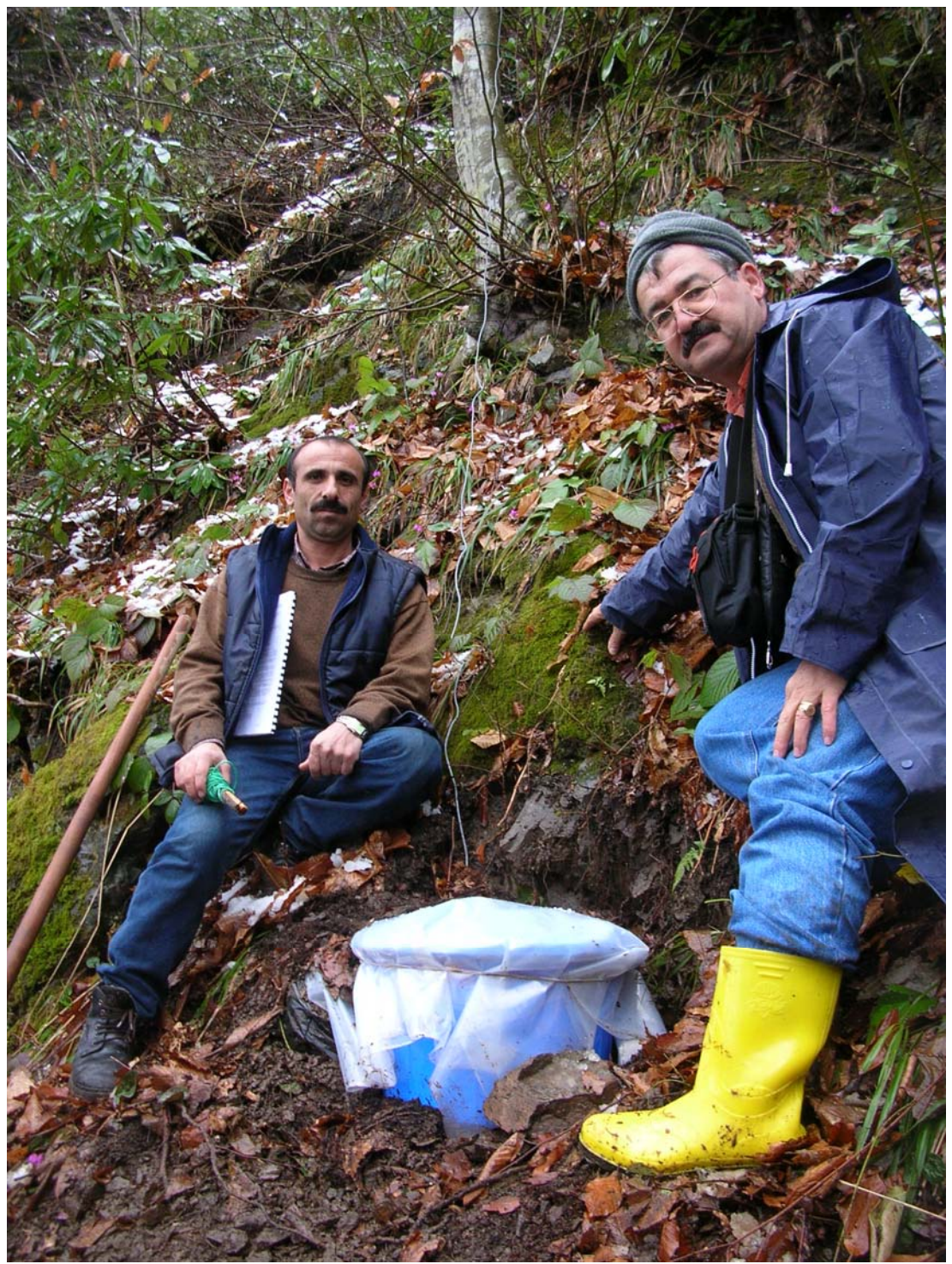
`High Up' (prepared 31/1/05, deployed 1/2/05, serviced and removed 15/2/05, reprepared 15/2/05, redeployed 17/2/05). Original site had gps lock problems but did get offset and drift when we checked text file. Recorded earthquake activity before experiment. New site called `Not So High Up' and all following details refer to this new location.