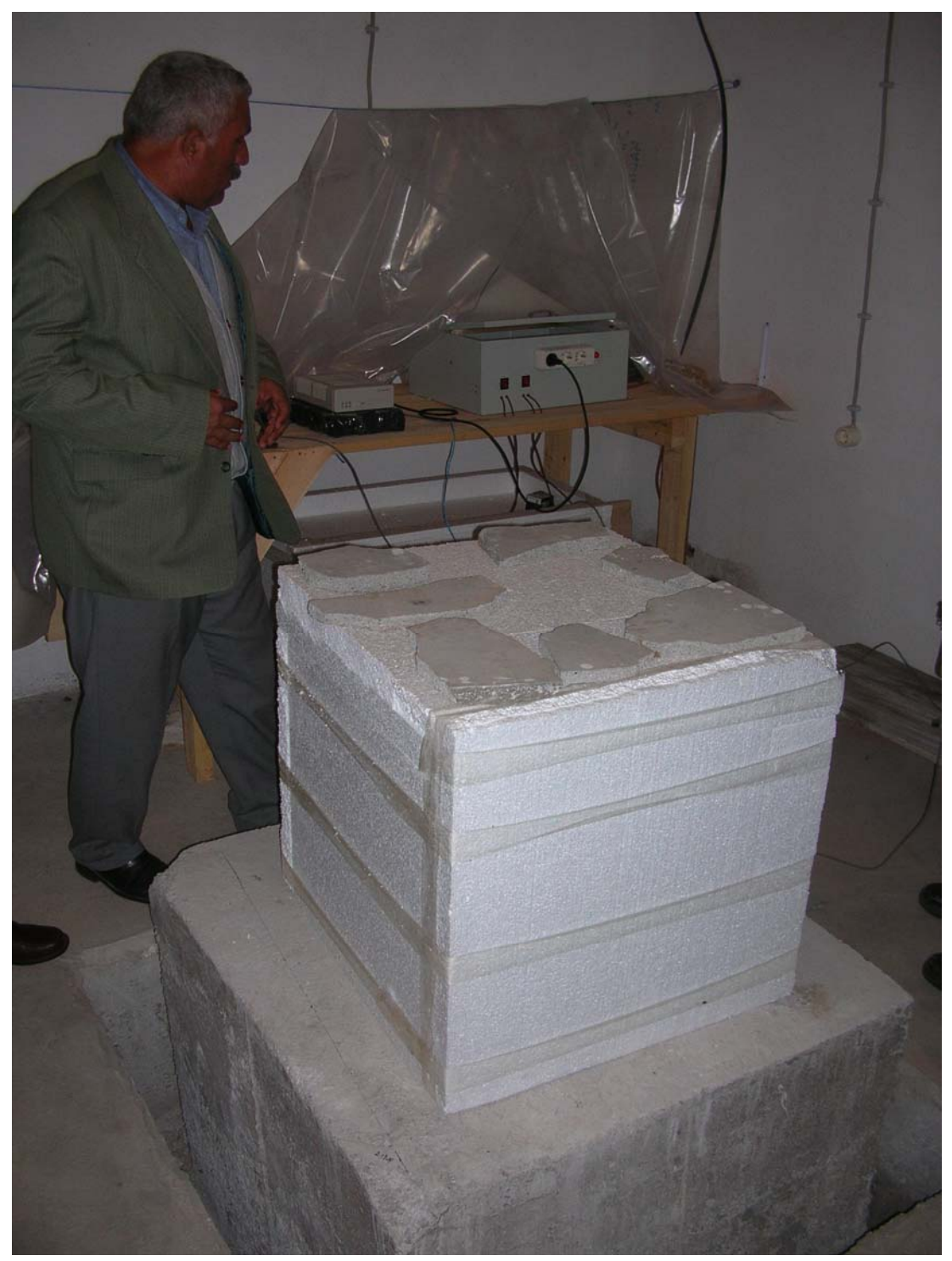
`KVTB' (continuous recording with 50 samples per second).

Location: 41 4.84 N, 36 2.78 E; 37 T 251737 4551655