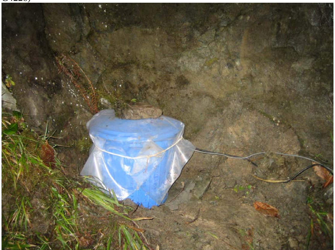
<u>Station 1.4</u> (original CMG-6TD-6128, G4219; replaced with CMG-6TD-6092, G4226)

`Kick the Bucket' (prepared 1/2/05, deployed 2/2/05, serviced 13/2/05, reprepared 15/2/05, redeployed 18/2/05). Original site never achieved offset and drift despite having a 3D lock. Earthquake recordings are therefore of little value. New site called KFB and all following details refer to this new site.