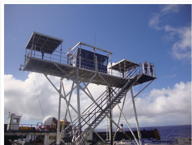
Figure 2. Protected Species Observers watching for marine wildlife.

Once the streamer and guns were in place, it was smooth sailing in terms of the instruments; the seas, on the other hand, were the contrary. The wind increased to 30 knots and the seas grew to 4-6 meters. Large seas, as you can imagine, change life aboard a ship. Everything is in constant motion. Sleeping was another story. Imagine sleeping in a moving bed...not conducive to quality rest. The way I solved that problem was by stuffing a bunch of blankets under one side of my mattress. This in effect created a v-notch that basically held me in one spot.