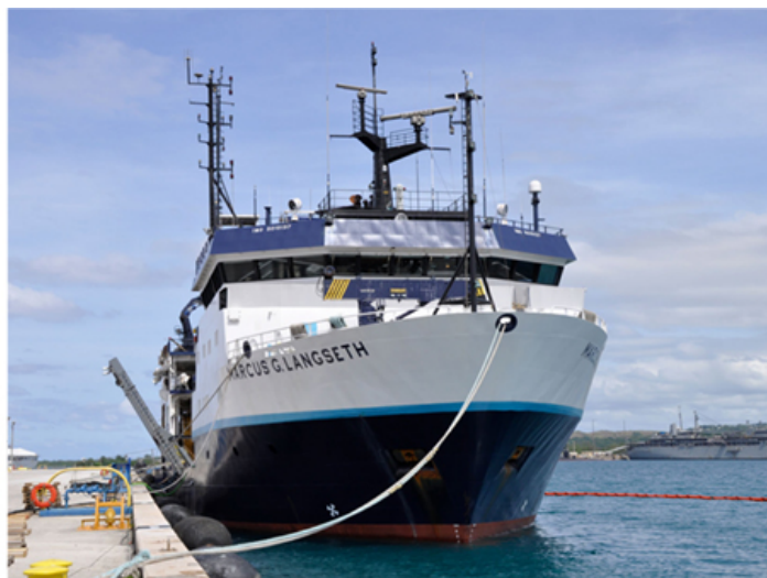
Figure 1. The two ships used for the Mariana seismic experiment: (left) R/V Thomas G. Thompson, operated by the University of Washington; (above) R/V Marcus Langseth, operated by Columbia University.

Life at Sea: 8,653 miles, 4 airports, 3 inflight meals, and 34 hours later, I'm standing in the Hagåtña, Guam Airport. In my post trans world flight delirium "What the hell have I gotten myself into this time?" pops into my mind. I collect myself and step outside into the warm Pacific night air. A stark contrast from the arctic chill I left in Maine. I arrive at the hotel...sweet, sweet sleep.