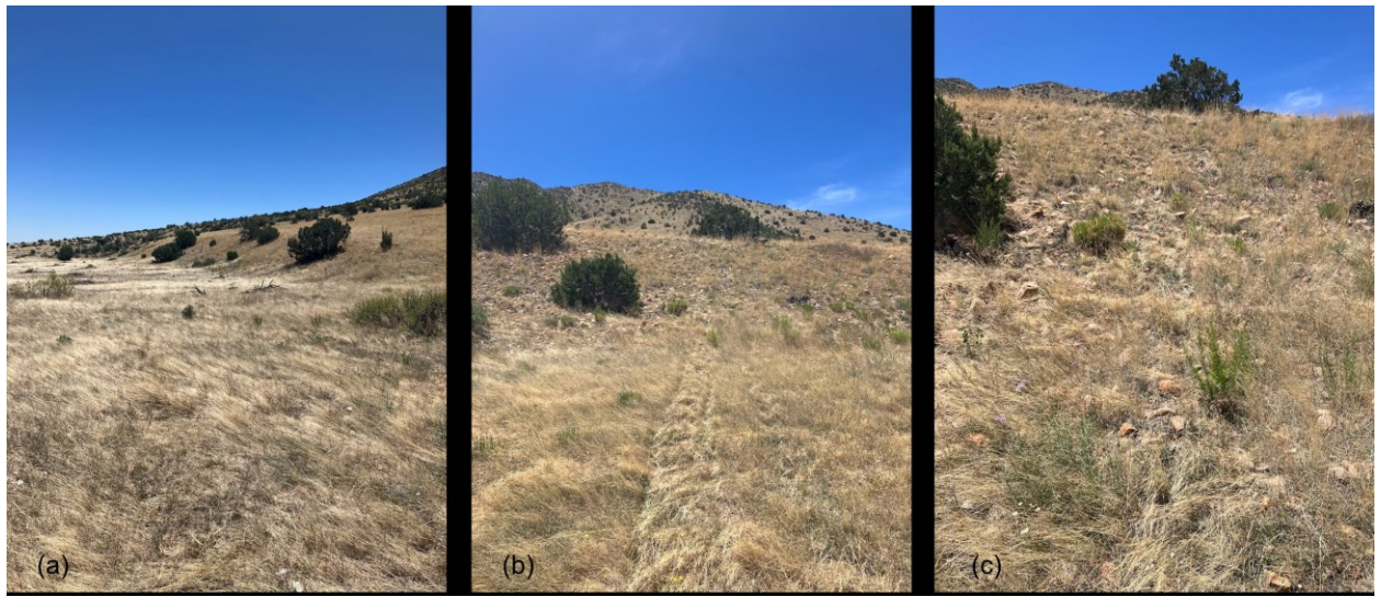
Figure 3: Ground cover and site photos: (a) Looking SE towards the steeper region of the scarp; (b) looking SW ("W") up scarp, showing GPR cart tracks and steeper SE portions of the scarp; (c) looking SW ("W") up the scarp showing vegetation and uneven, rocky ground surface.