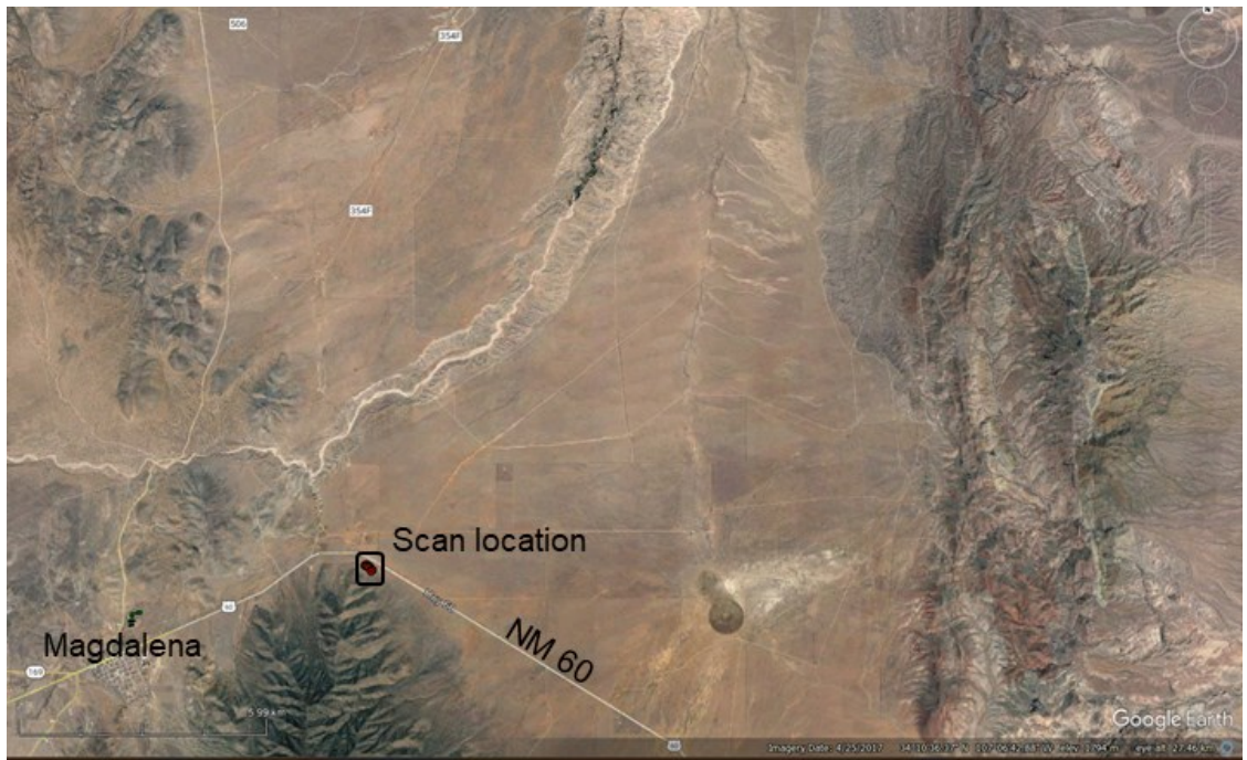
Figure 1: Google Earth imagery showing broader context of site location near Magdalena, NM

Site Description: The La Jencia Fault or Magdalena Mountain Fault zone runs generally N-S on the eastern side of the Magdalena Mountains. One scarp area located South of NM Hwy 60 just past mile marker 117 was scanned on May 7, 2023 in this project ("Project 1" in the default naming and file structure, Figure 1). GPR lines are collected with a 250 MHz Sensors and Software Noggin antenna with external GPS in the Smart Cart configuration. Scans are collected roughly perpendicular to the scarp at four locations, in both an up-scarp ("E-W") and down-scarp ("W-E") direction at each location (Figure 2).